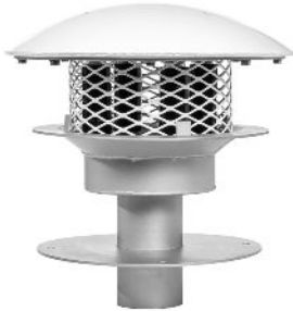
patent # US 10,907,356 B2