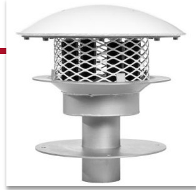
patent # US 10,907,356 B2